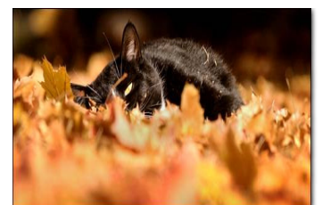
HELEN URSBACH / THE OREGON JOURNAL